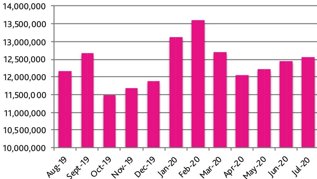
Website impressions/page views per month

Average monthly page impressions = 12,595,543